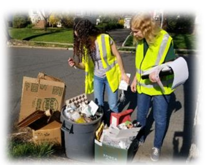
Borough of Chatham residential recycling setouts tagged and stickered for contamination issues. The three photos on the left and middle show containers recycling containers with unacceptable materials such as textiles, undesirable plastics, batteries, trash, and food-contaminated materials. The photograph in the middle shows US currency set out for recycling. The picture on the left shows MCMUA personnel during inspections.