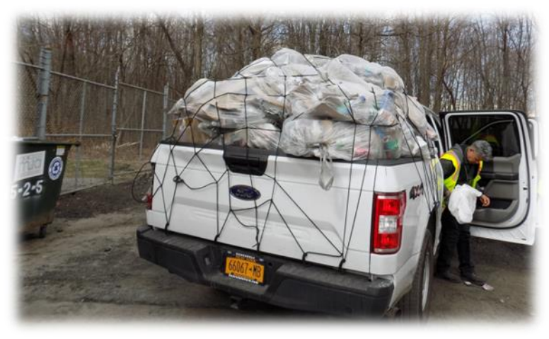
Pictured above left is the final report from the contractor, and above right is a photo of one of the several truckloads of litter collected during cleanup efforts.