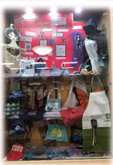
Pictured above are the photos of the display cases at the Morris County Library